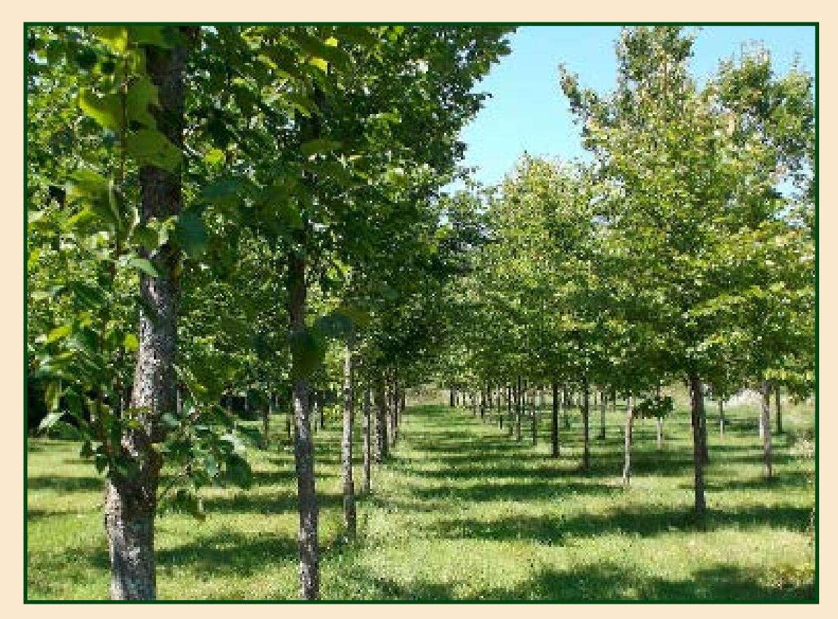
These 3"-5" caliper disease-resistant specimens of 'Ulmus americana libertas' are now available with cast bronze plaque for planting as Liberty Tree Memorials.

Call Yvonne at (603)209-2434 for pricing. FOB, Keene, NH